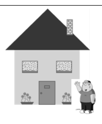
Daddy is close. He is at home.